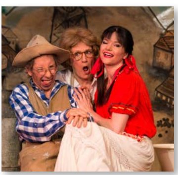
Footlights Dinner & Show