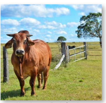
Henderson Park Station